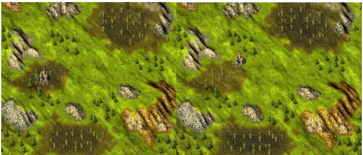
Example of different coal generation at same location

Players do not know the map where they will play. Map is generated at start of the game based on creation templates. There are 330 different locations templates. Each location might have different amount of mines, coal, fish and wine fields. Placement of resources, amount and possibilities to make mines are different each time you play any location.